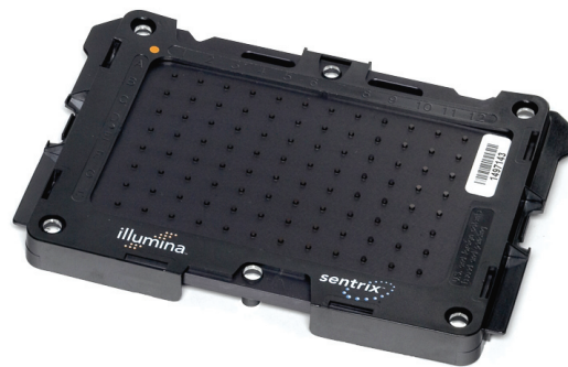
FIGURE 1: AFRICAN AMERICAN ADMIXTURE PANELS ARE DEPLOYED IN MULTI-SAMPLE SENTRIX ARRAY MATRIX FORMAT

Admixture mapping experiments are facilitated by high-throughput sample analysis. Marker panels are deployed on a 96-sample Sentry® Array Matrix.